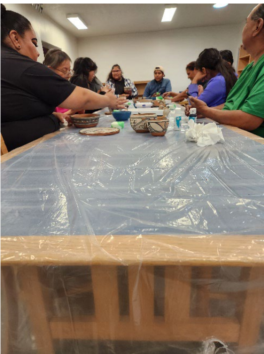
Multi-generational pottery class at Santo Domingo Pueblo Library

The New Mexico State Library (NMSL) is committed to providing leadership that promotes effective library services and access to information to all citizens of New Mexico. The State Library provides services that support public libraries as well as delivers direct library services to rural populations, state agencies, the visually impaired and physically disabled, and students and citizens conducting research.