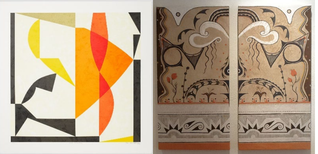
Dan Namingha, Points Connecting

The primary function of New Mexico Arts (NMA) is to provide financial support for arts services and programs to non-profit organizations statewide and to administer the 1% public art program for the state of New Mexico.