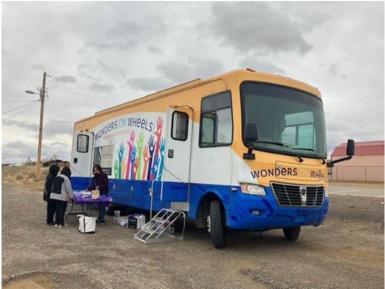
WoW visit to Acoma Learning Center, March 2023