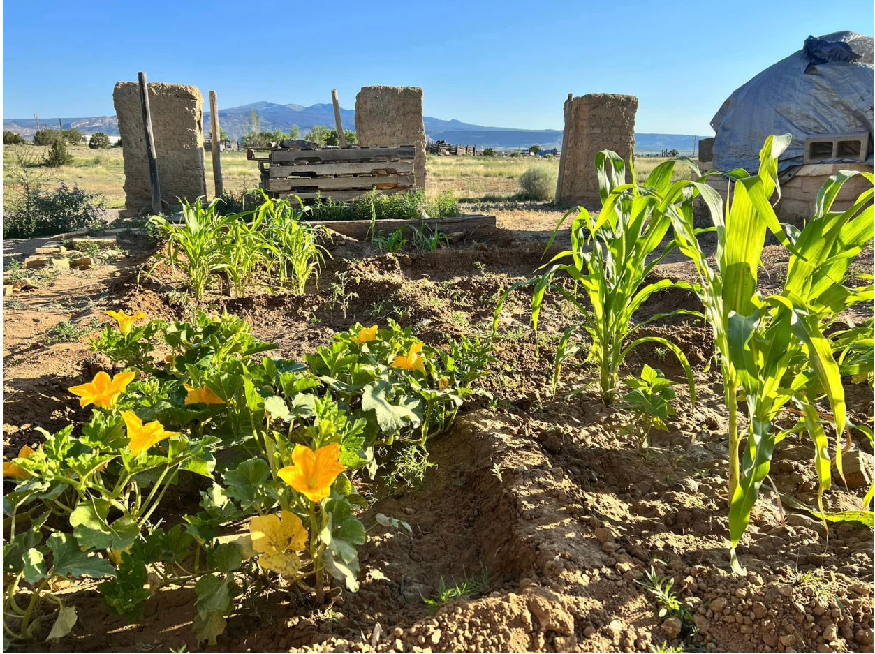
Squash and corn in the garden, a component of the Niutimegu Project at Acoma Learning Center. San Estevan del Rey Mission, Convento Courtyard, Pueblo of Acoma

2023 State Tribal Collaboration Act Annual Report