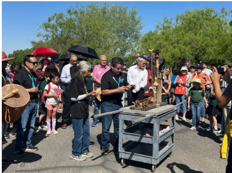
Blessing of the Fields ceremony, May 2023

The New Mexico Farm & Ranch Heritage Museum connects to and interacts with diverse communities through exhibitions, programming, and tours for the people of New Mexico and the state's many visitors.