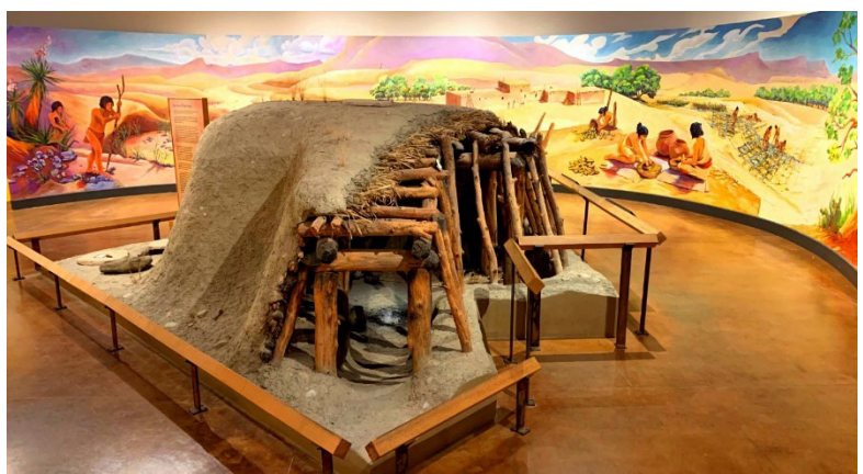
Mogollon pithouse and mural in the Early Agriculture section of the main gallery