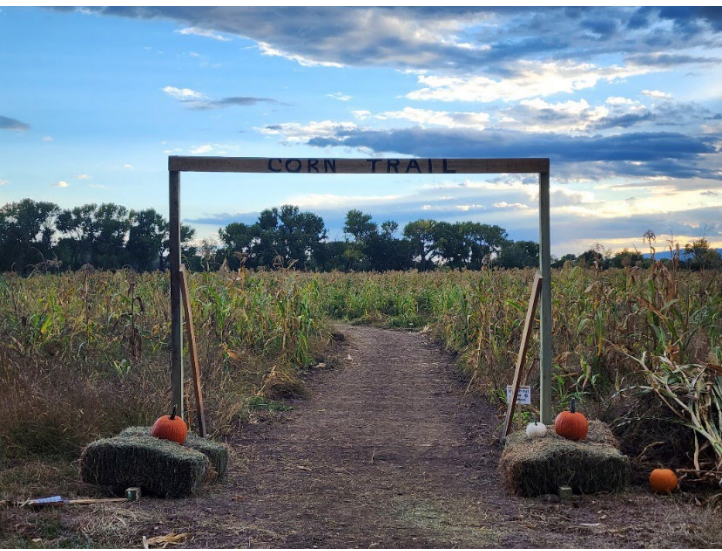
Blue corn field at Los Luceros Historic Site

The New Mexico Historic Sites system maintains seven publicly accessible sites: Fort Sumner/Bosque Redondo Memorial, Coronado, Los Luceros, Fort Selden, Jemez, For Stanton, and Lincoln. Many of which actively partner with New Mexico's tribal communities.